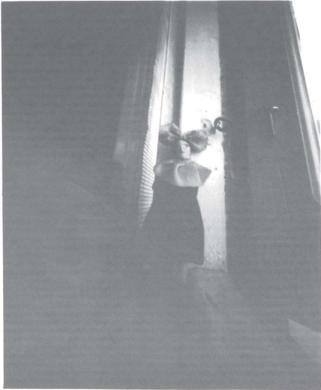
Muñeca con ventana , 1985