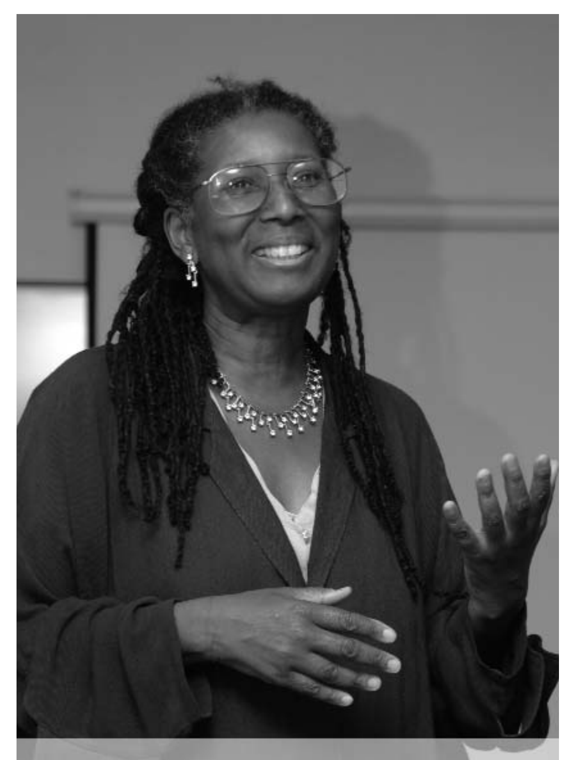
Administration & Faculty